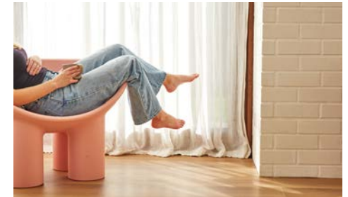
Duracore® Ultra / Arrowtown