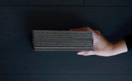
Duracore® Silent / Herringbone