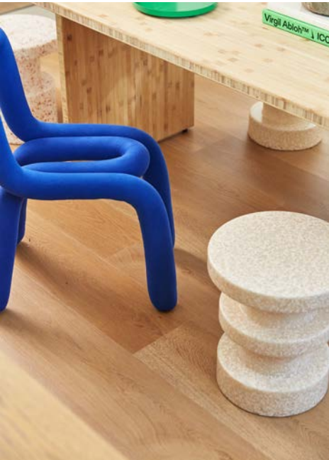
Duracore® Lifestyle / Akaroa