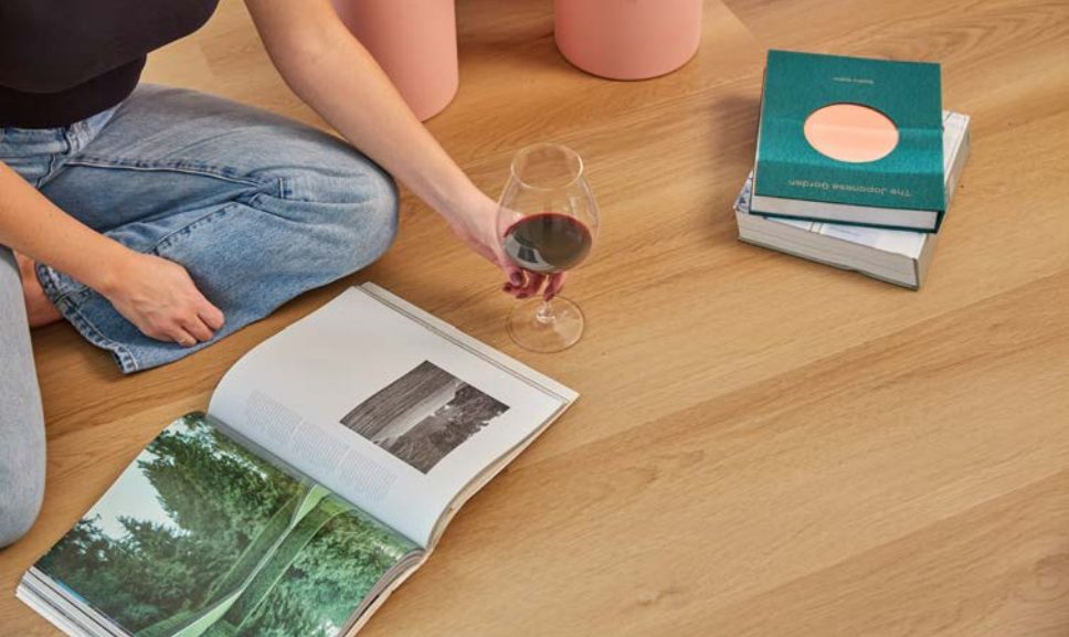
Duracore® Lifestyle / Akaroa