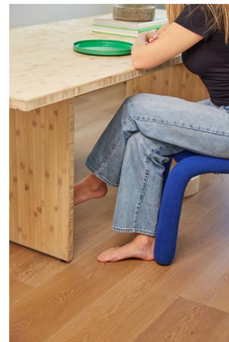
Duracore® Ultra / Akaroa